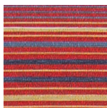
02 Red & Blue