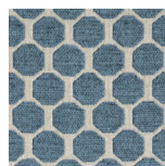
10 French Blue