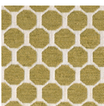
07 Old Gold