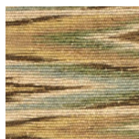
03 Taupe & Teal