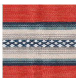
02 Desert Rose