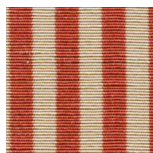
04 Indian Red